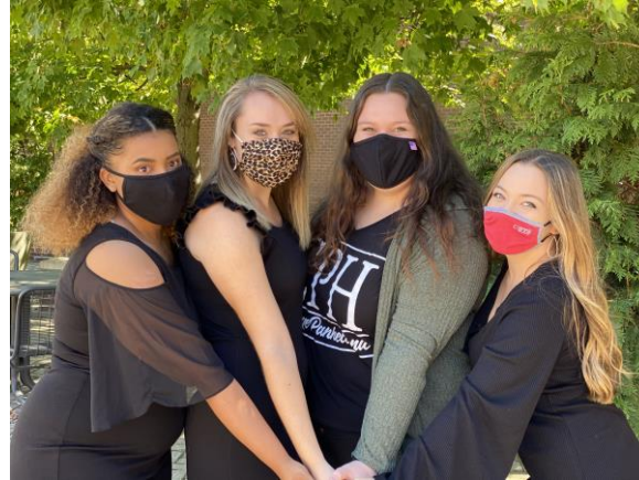
Panhellenic Council during sorority recruitment