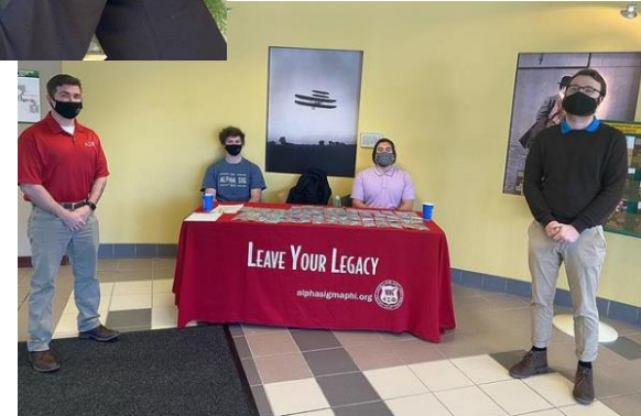
Alpha Sigma Phi tabling for their national philanthropy RAINN