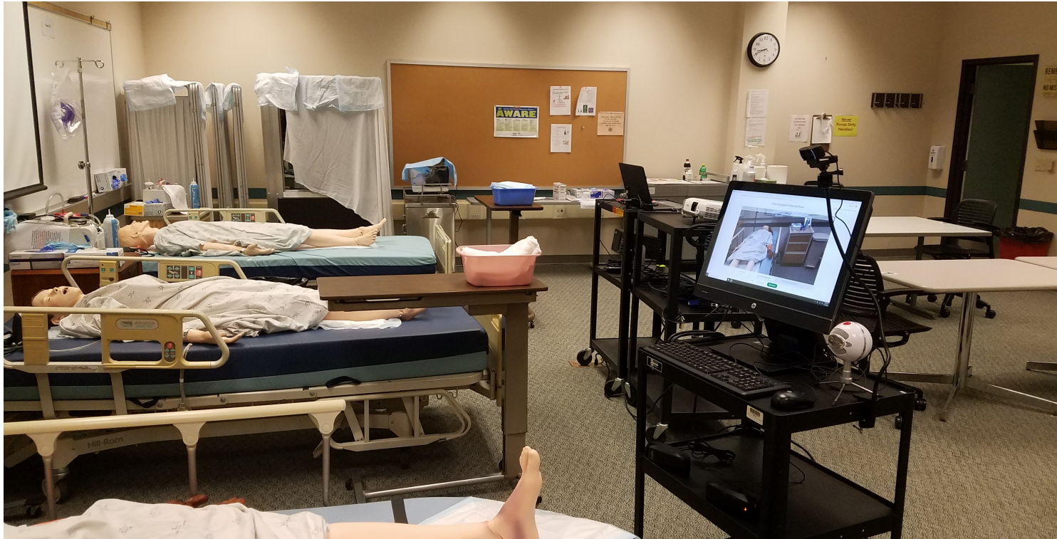
Nursing Mobile Cart