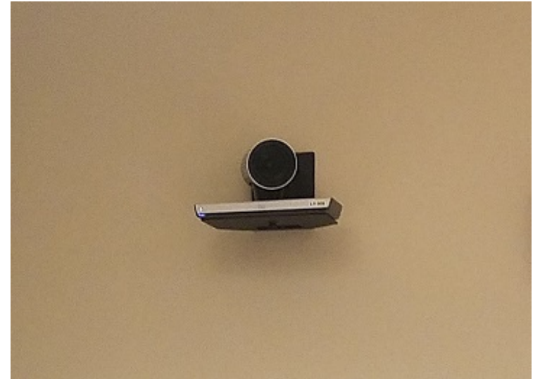
Wall-mounted Cisco Camera