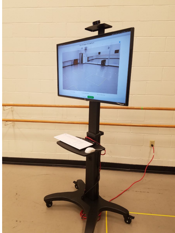
CAC Mobile Cart