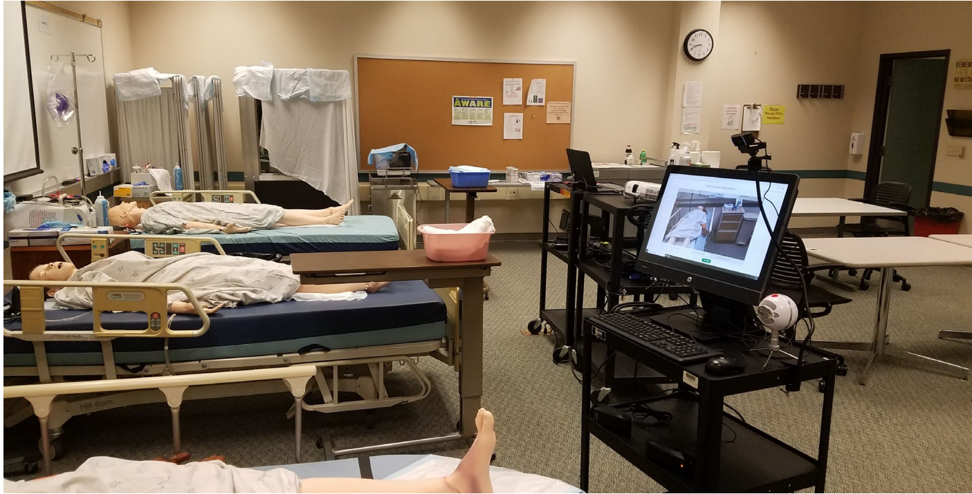
Nursing Mobile Cart