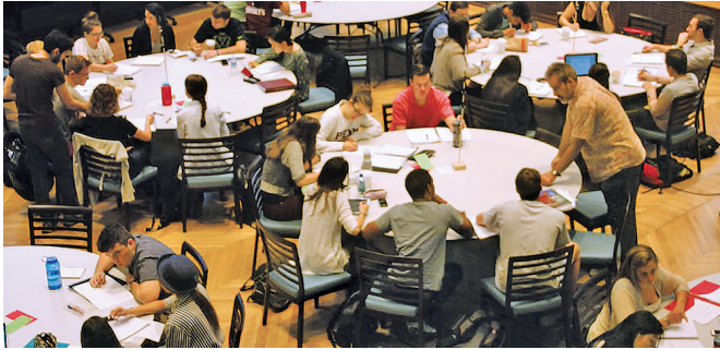
A structured, active, in-class learning (SAIL) class at University of Pennsylvania.

background and experience, and for different kinds of students.