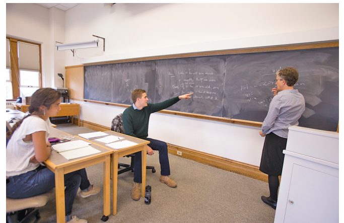
An inquiry-based learning course in abstract algebra at Middlebury College.

Inquiry-Based Learning. One of the most well-known active learning methods in mathematics is inquiry-based learning (IBL). In IBL courses, class time is spent with students working on problem sets individually or in groups, presenting solutions and/or proofs to the class, and receiving feedback from peers and faculty. IBL courses are not based on pure, unguided student discovery; instead, faculty design a series of carefully scaffolded (i.e., sequenced in a structured way) activities, some for individuals, some for pairs, some for small groups, and some for the whole class, including mini-lectures as appropriate. Because faculty using IBL need to develop facility with a range of teaching strategies and need to develop