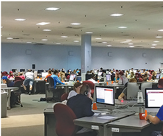
The Math Emporium at Virginia Tech.

familiarity with many “teaching moves” that are not typically used in lecture environments, IBL is a more ambitious active learning environment. There are various opportunities for professional development with IBL, including the workshops offered by the Academy for Inquiry-Based Learning at www.inquirybasedlearning.org .