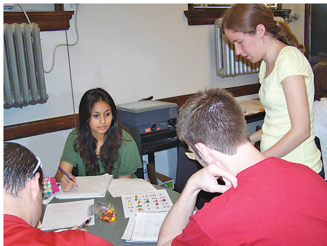
An active learning course from the Merit program at University of Illinois Urbana-Champaign.

Active learning often has a particularly positive impact on student persistence and sense of belonging.