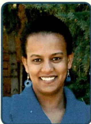
◀ Ethiopia Ph.D. in Counselor Education