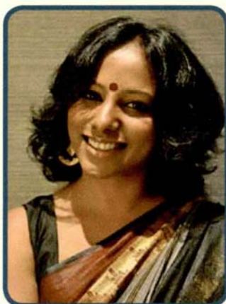
◀ Malaysia Master of Fine Arts Documentary Studies and Production

The P.E.O. International Peace Scholarship Fund provides scholarships for selected international women for graduate study in the United States and Canada.