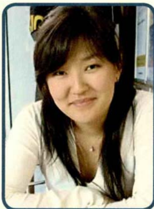
Mongolia ▶ Master of Arts in Law and Diplomacy