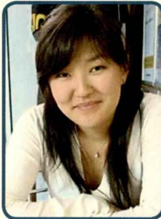
◀ Ethiopia Ph.D. in Counselor Education