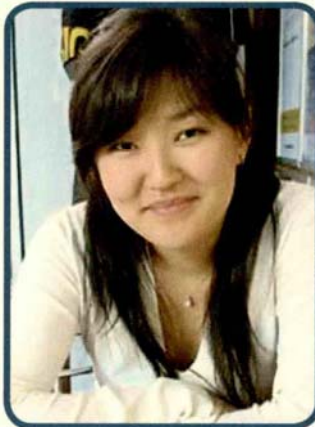
◀ Ethiopia Ph.D. in Counselor Education