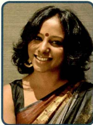
◀ Malaysia Master of Fine Arts Documentary Studies and Production

The P.E.O. International Peace Scholarship Fund provides scholarships for selected international women for graduate study in the United States and Canada.