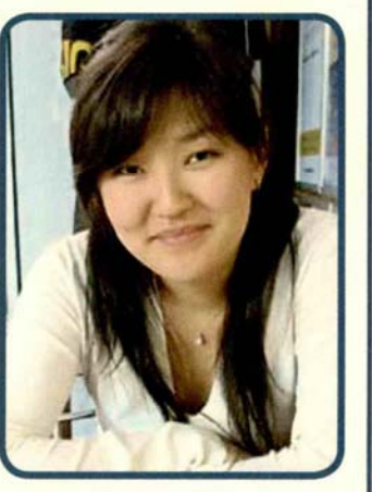
Ethiopia Ph.D. in Counselor Education