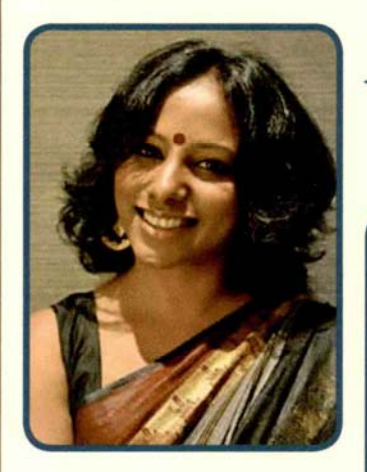
Mongolia Master of Arts in Law and Diplomacy

The P.E.O. International Peace Scholarship Fund provides scholarships for selected international women for graduate study in the United States and Canada.