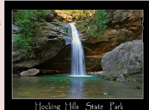
Hocking Hills State Park

Hocking Hills state park is the most visited park in the state of Ohio. It has been voted the best place to camp in the USA! With it's amazing rock formations, beautiful fall leaves, wonderful hiking trails, and interesting ravines you will really enjoy visiting this park. You can learn more about the park at http://www.hockinghills.com/old_mans_cave.html .