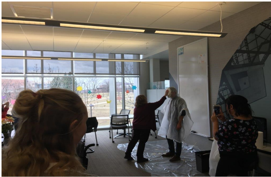
Pi Day March 2019