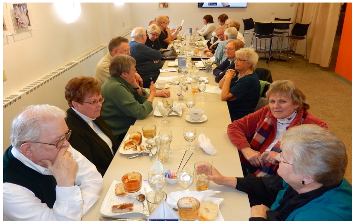
Lunch at the DAI