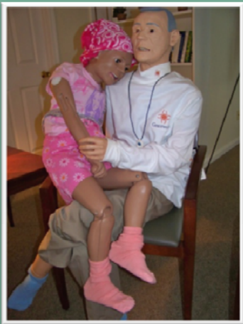
Hugs for Grandpa