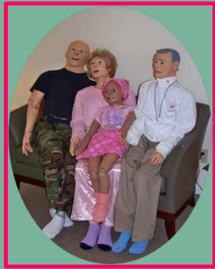
Since his stroke, Grandpa needs more rest