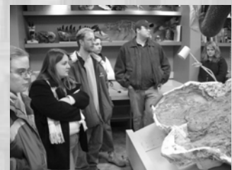
Touring the collections area at the Indianapolis Children's Museum

In February of 2007, students visited the Indianapolis Children's Museum. On this trip, they were able to get a behind-the-scenes look at the museum's collections area, as well as a tour of the archives at Indiana University-Purdue