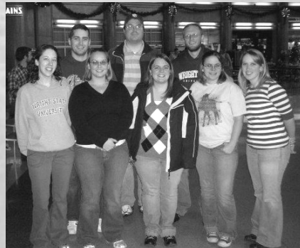
WSU Public History students and alumni gather in the Union Terminal lobby in Cincinnati.