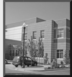
The Utah State Archives building, which opened in 2004.

I get to the Archives at around 7am. It's a fairly brand new building with a really amazing ASRS (automated storage retrieval system). Just imagine never walking up and down the isle looking for that box you know is there but you just can't find!