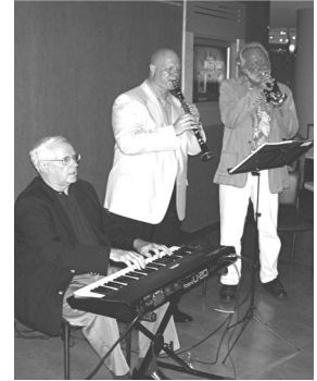
2005 Fall AAUP-WSU Social